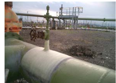
REPAIR WITH VALVE FEATURE

Clock Spring® Contour can be used for leak repair, even challenging environments with complicated pipe architecture and design.