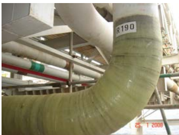
PROCESS PLANT, REFINERY AND OFFSHORE PIPE REPAIRS

An engineered repair designed using Clock Spring® Contour will help ensure your repairs are applied quickly and get you safely to the next scheduled turn-around.